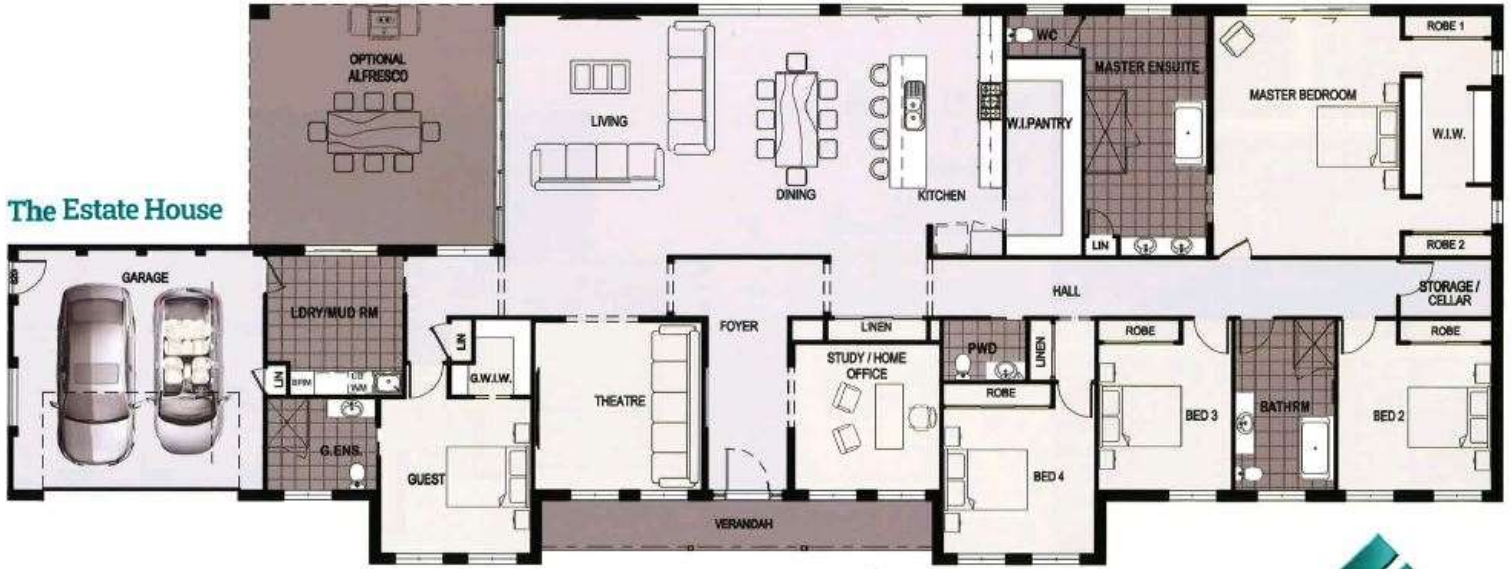
The Estate House